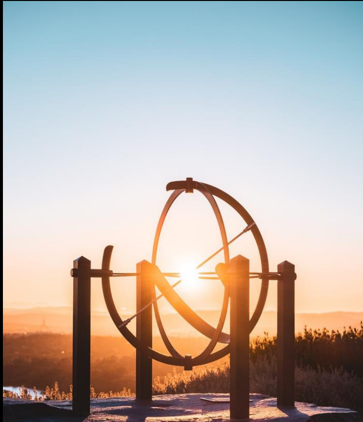
ANU stock photo