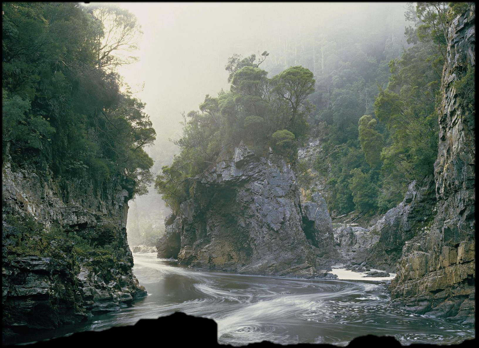
Peter Dombrovskis, Morning mist, Rock Island Bend, Franklin River, Tasmania c. 1980