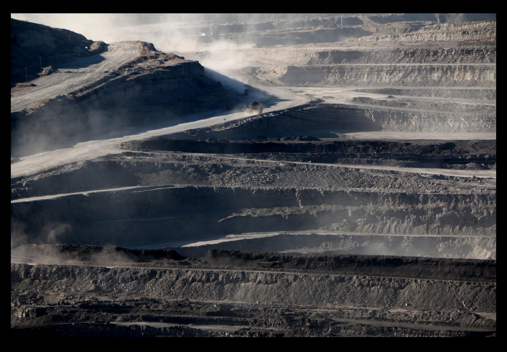
We should leave the black gods in the Earth so that they might slumber undisturbed