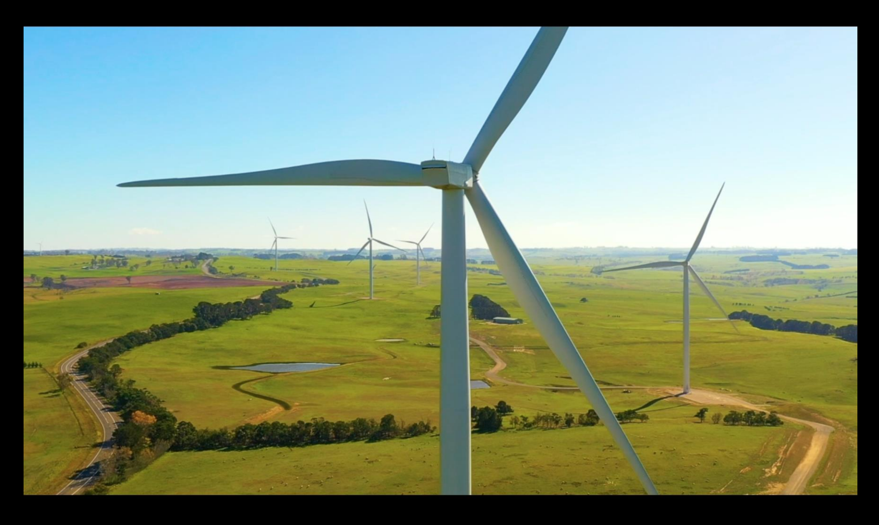
We must turn the tide, banish the black gods to the deep and look for new gods in the sun, wind and sea