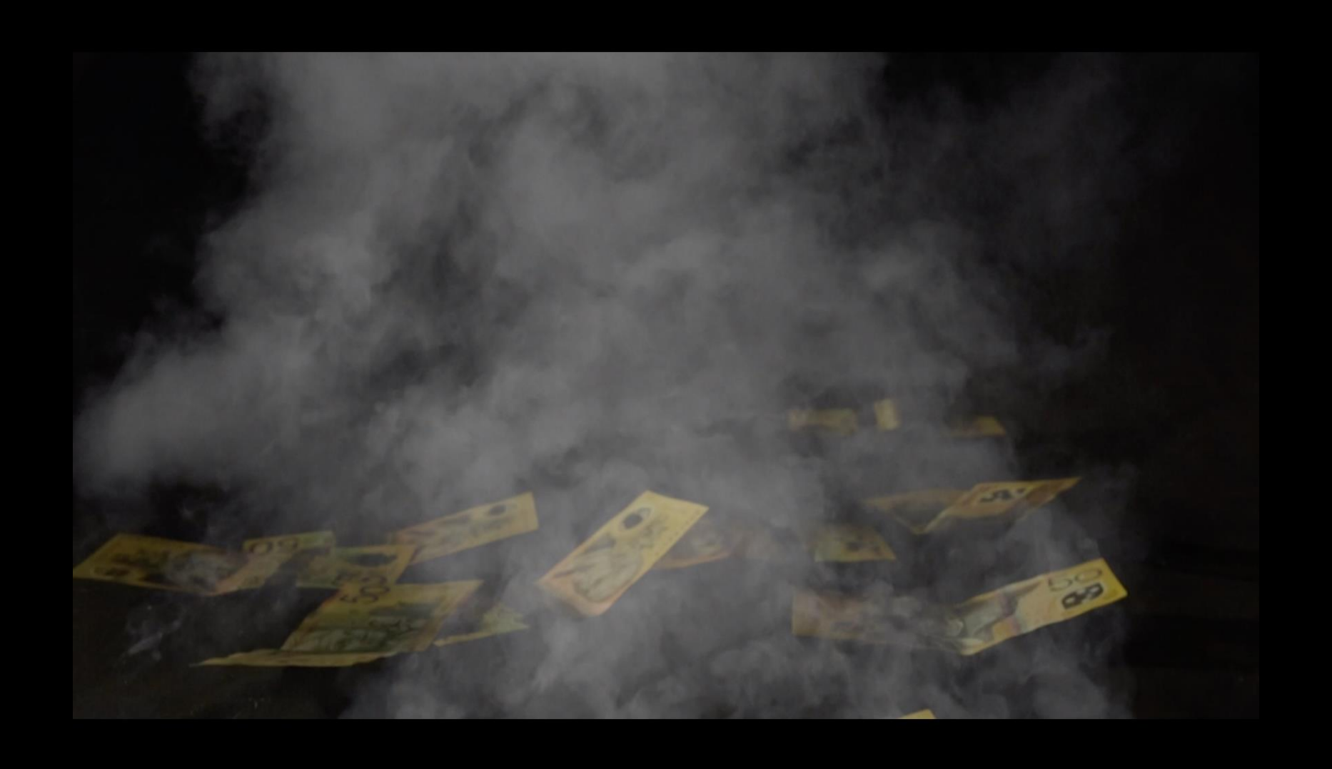
We have released forces not seen before in our time