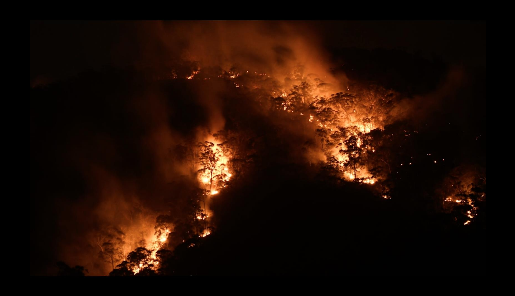
Leaving us to dwell in the wake