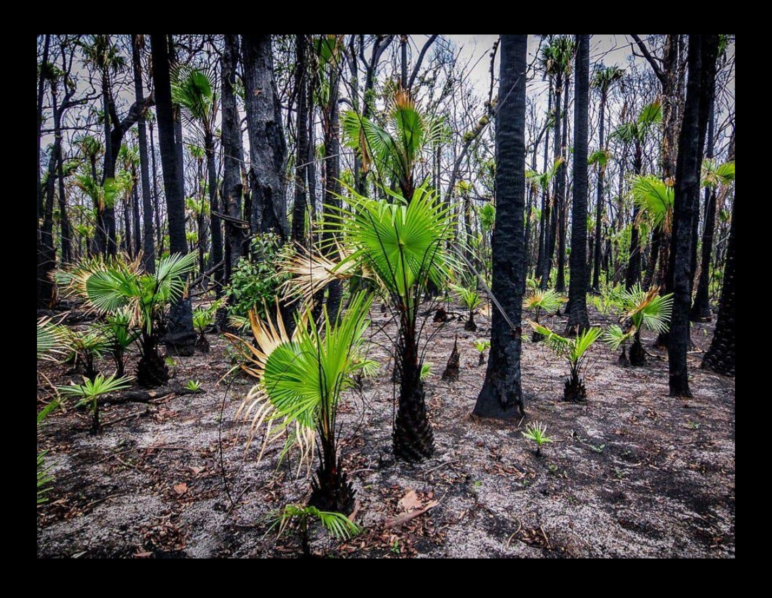
Nature will forgive, cool ing the fires of our minds as she has done before